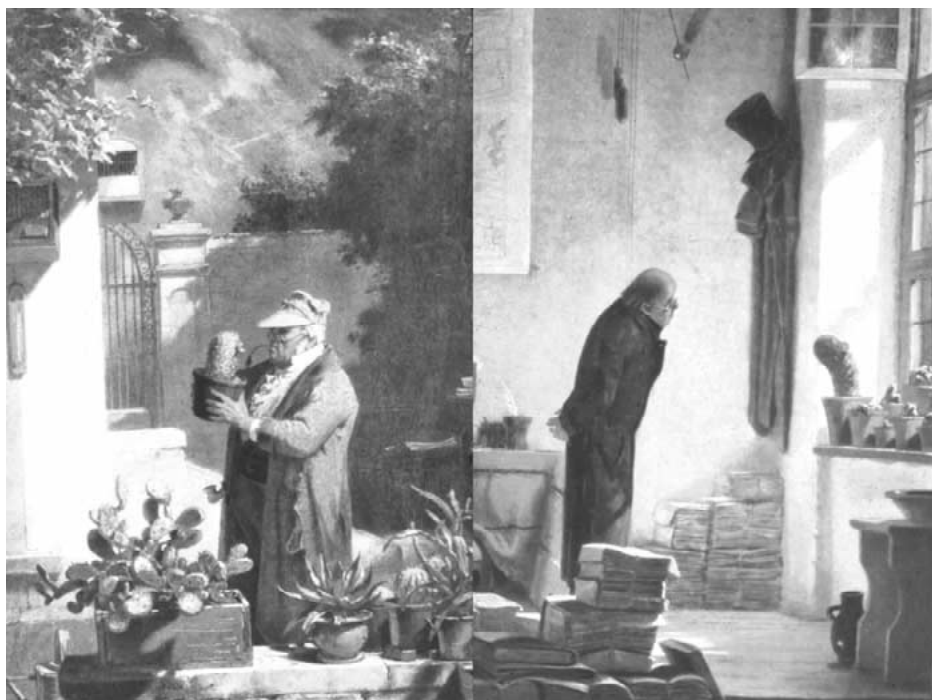
Figure 1. Romantic paintings by Carl Spitzweg, 'cactus lovers,' illustrating the powerful environmental survival ability of CAM plants and human attachment.

'daily acid taste cycle' has been known showing that acids were formed at night and disappeared in the day in specific plants. In fact, Heyne's 'daily acid taste cycle' foreshadowed the direction of research even until today to understand CAM, namely, by measuring daily cycles! Even with these clues centuries would elapse before the acids and other components of daily CAM cycles would be positively identified, accurately measured, and CAM photosynthesis begin to be understood.